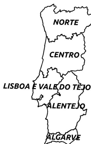
Figure 1 - Health regions of Portugal country